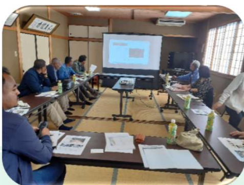
At a community hall as they visits Takamine Farm

They showed a strong interest in “hamlet-based farm management system” and “the roles of agricultural cooperatives in production and marketing,” and will to further study and deepen their understanding of actors and resources involved in the value chain.