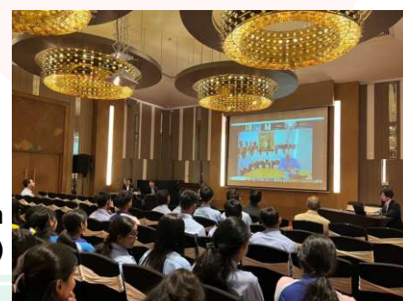
General Information Session (India)