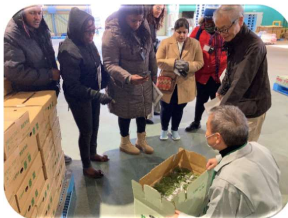
At JA Chibamidori Observing how the products are packed

During their stay in Japan, the participants enjoyed the Japanese food and contact with Japanese people during their stay in Japan. Above all, they said that learning about Japanese agriculture was very helpful and that they would definitely like to put it into practice when they return to their own countries.