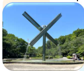
View of Serigaya park