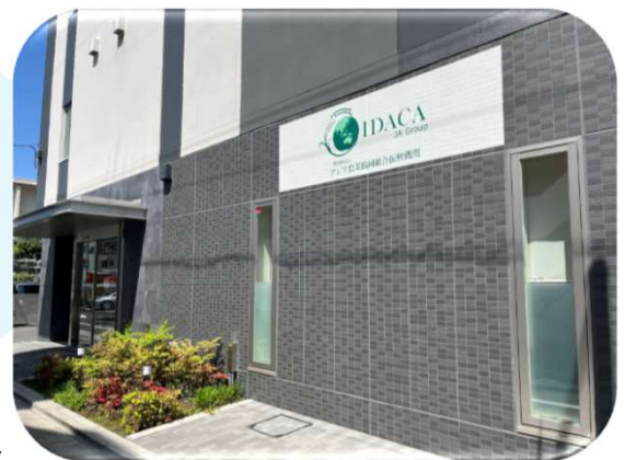
IDACA office in Morino, Machida city