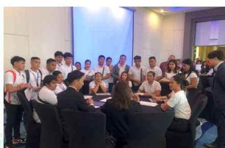
Consultation in Groups (Philippines)

IDACA will continue to support this project in the future, with information sessions scheduled to be held in five countries in FY2024.