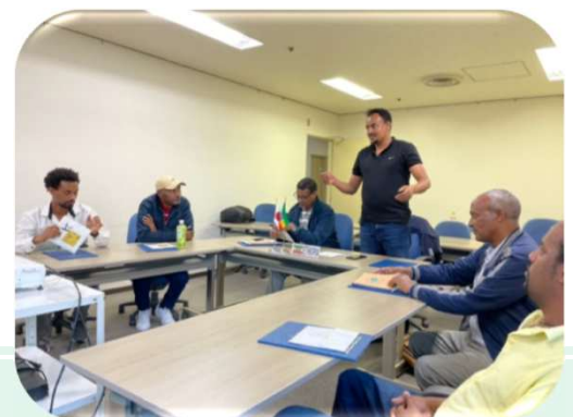
The participants at the evaluation meeting with JICA