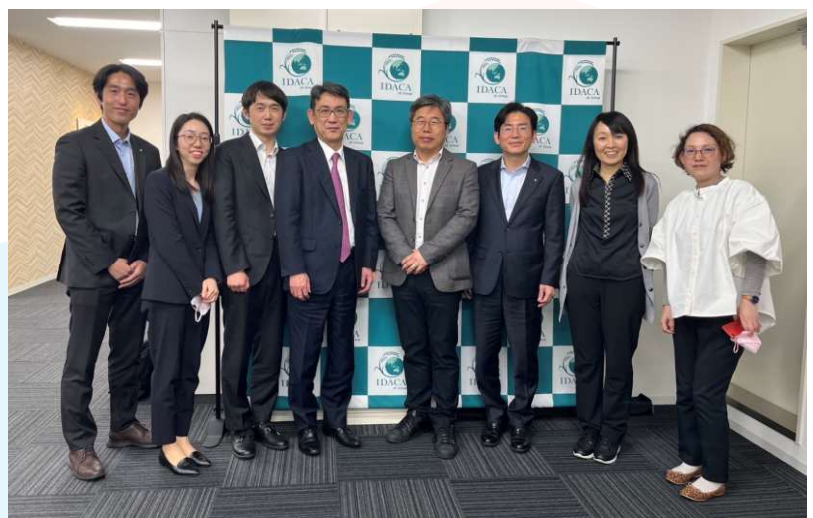
IDACA staff welcomed NACF staff