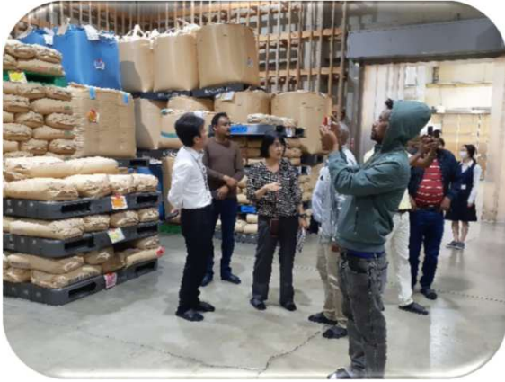
At a processing plant of Beishin Ishikawa Inc.

This is the second training program organized based on an ongoing project in Ethiopia. Six central and local government officials from the county were invited to the program which was held in Tokyo and Ishikawa prefectures, following last year's program.