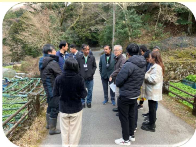
At JA Fuji Izu Wasabi Farm

ICA-MAFF (Japan) Training Course on “Promotion of Sustainable Agriculture and Improvement of Farmer's Income through Development of Agricultural Cooperatives in FY2023” was conducted from March 16 to March 29, 2024.