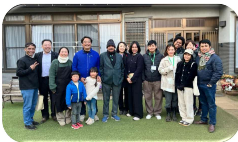
The participants at the evaluation meeting with JICA

The participants visited JA Fuji Izu to observe the development of farm management and marketing business, strawberry and wasabi production fields. And they visited JA Machida-shi to observe the development of financial business. The participants also had a chance to see examples of JA Youth and JA Group Kanagawa. They learned about the importance of communication methods and public relations activities to strengthen the organization and revitalize member activities. Furthermore, as measures for sustainable agriculture, they learned the sixth industrialization initiatives